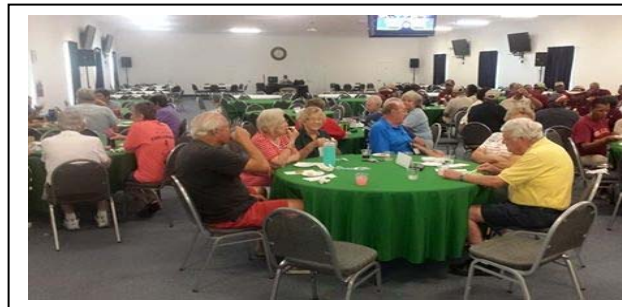
Dinner with the US RV Club