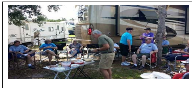
Social Hour under the trees